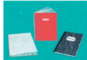
2 three notebooks.