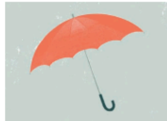
3 one umbrella.