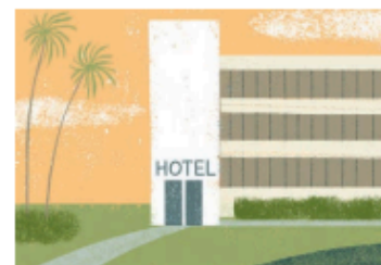
8 a hotel.