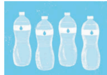
4 four bottles of water.