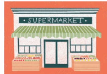
6 a supermarket.