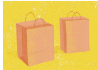
1 two bags.