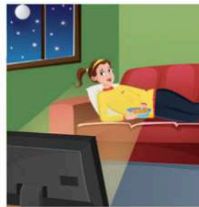
I never do any sport in the evening. I'm always tired.