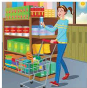
I usually go shopping in the afternoon.