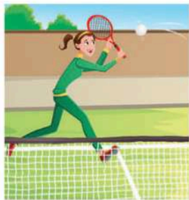
I often play tennis in the morning.